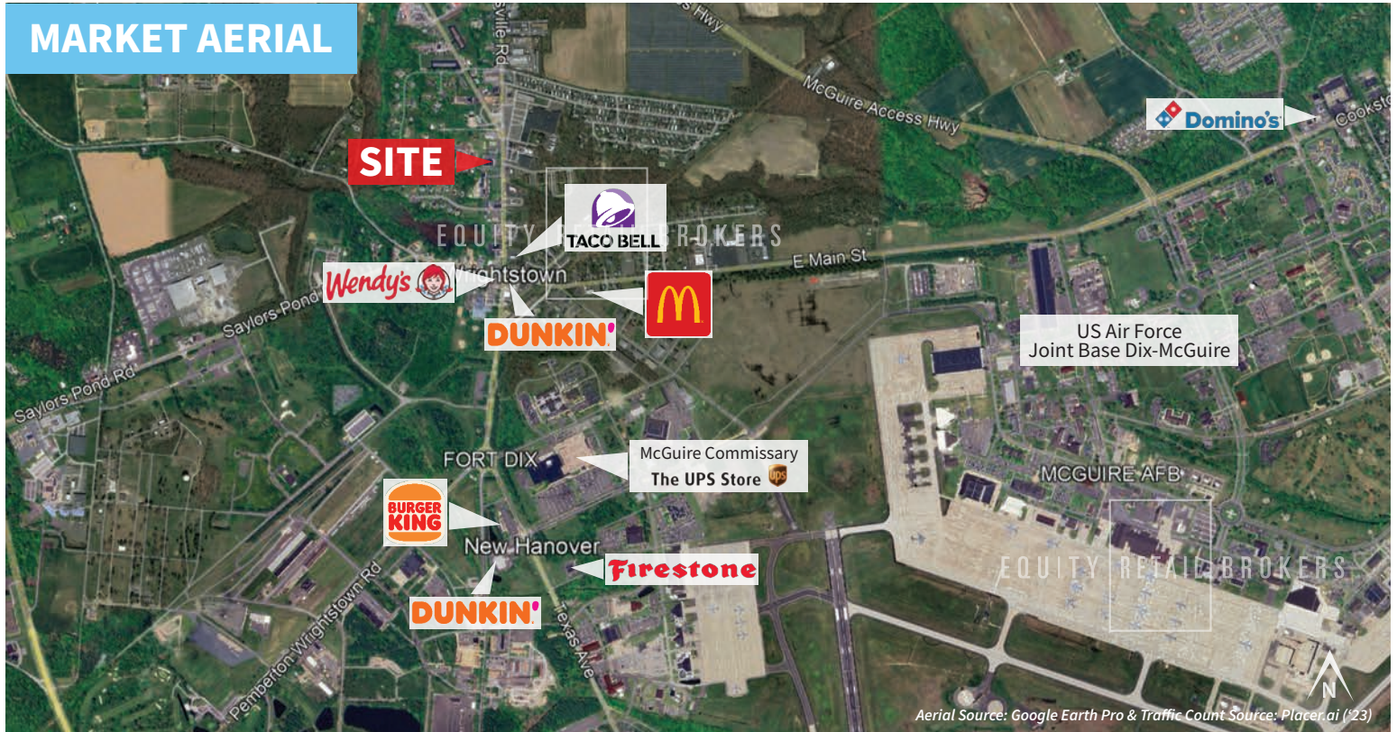
Aerial & Traffic Count