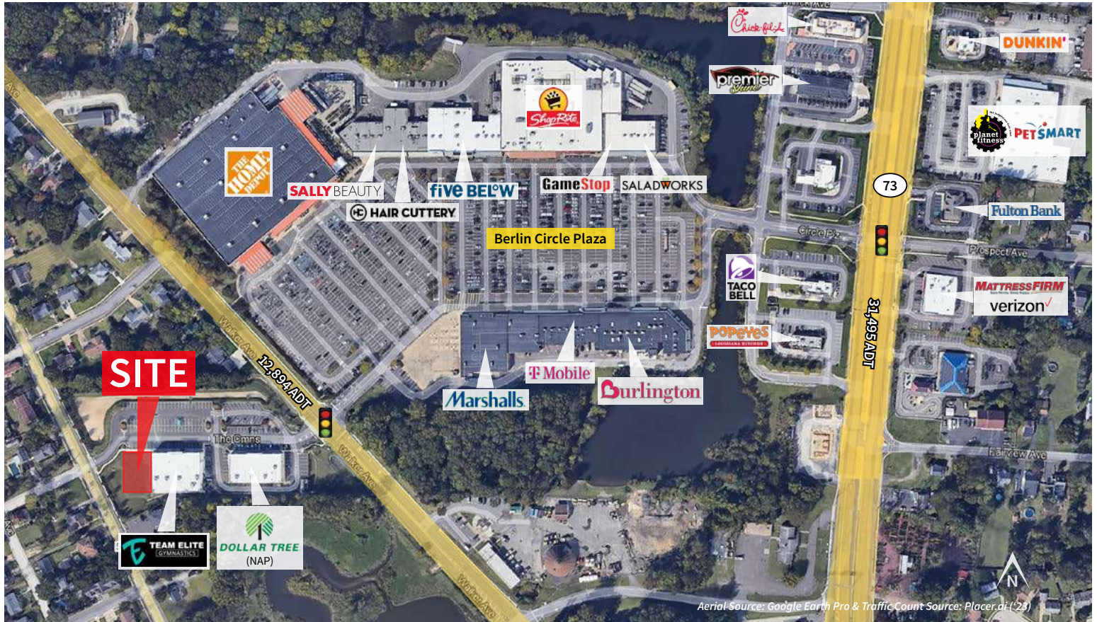
Aerial & Traffic Count (23)