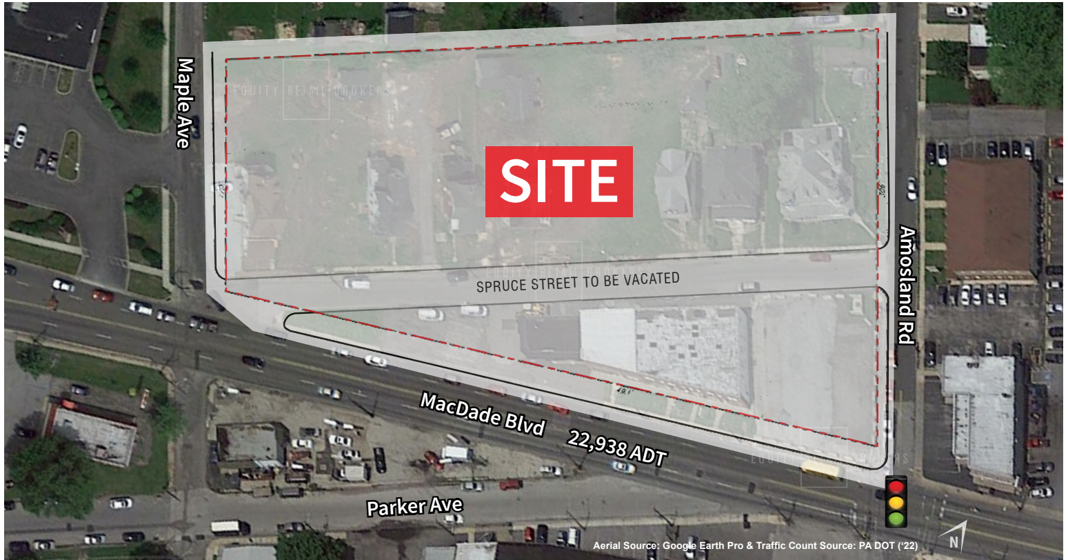
Aerial Source: Google Earth Pro & Traffic Count Source: PA DOT ('22)