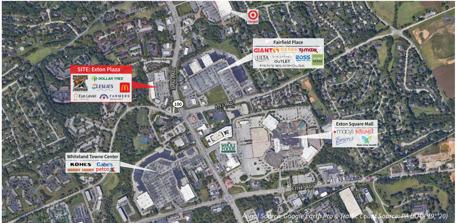
Aerial Source: Google Earth Pro & Traffic Count Source: PA DOT ('19, '20)