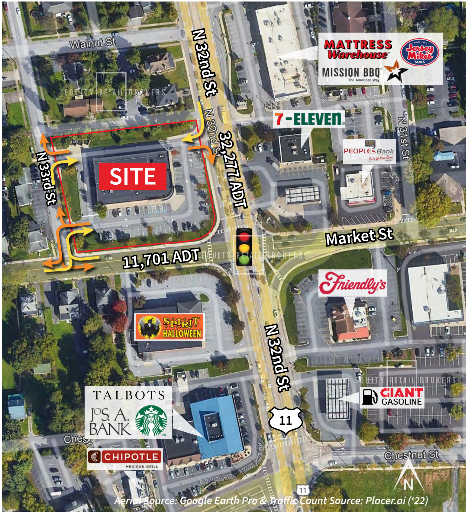
Aerial Source: Google Earth Pro & Traffic Count Source: Placer.ai ('22)