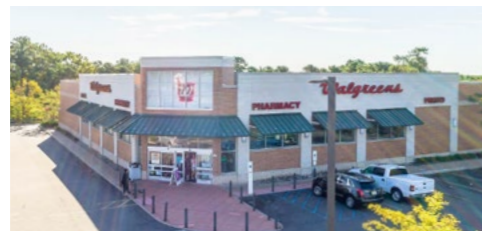
Walgreens, Barnegat, NJ