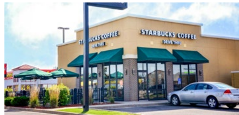
Starbucks, Eau Claire, WI