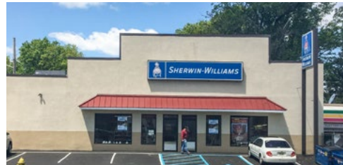
Sherwin Williams, Rahway, NJ