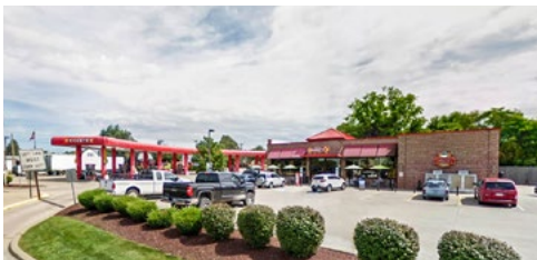
Sheetz, Westmoreland County, PA