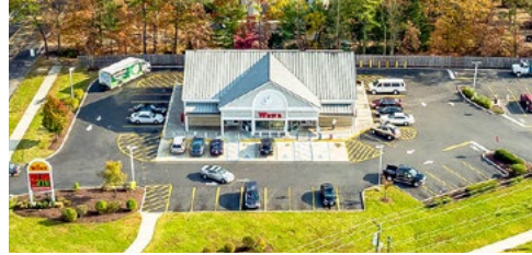
Wawa, Galloway, NJ