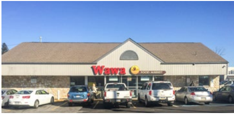
Wawa, Philadelphia, PA