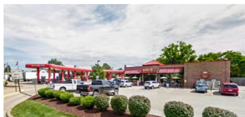
Sheetz, Westmoreland County, PA