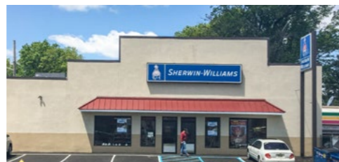
Sherwin Williams, Rahway, NJ