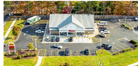
Wawa, Galloway, NJ