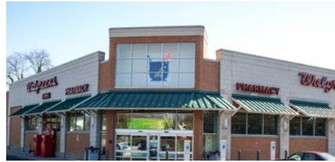
Walgreens, Levittown, PA