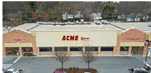
Media Shopping Center, Media, PA