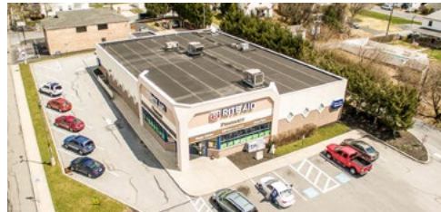
Rite Aid, Harrisburg, PA