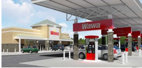
Wawa, Cinnaminson, NJ