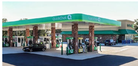
QuickChek, Raritan, NJ