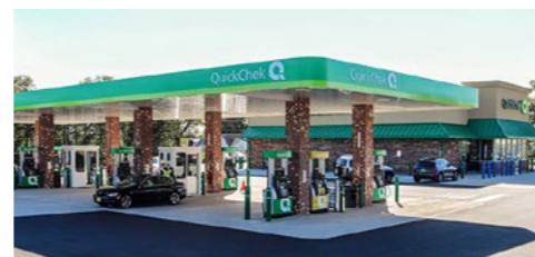
QuickChek, Raritan, NJ