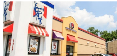
Taco Bell/KFC, Wilmington, DE