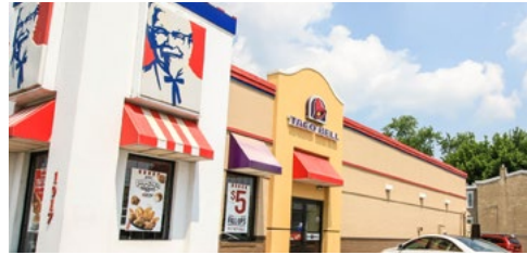
Taco Bell/KFC, Wilmington, DE