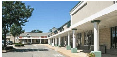
Shoppes at Lionville Station, Exton, PA