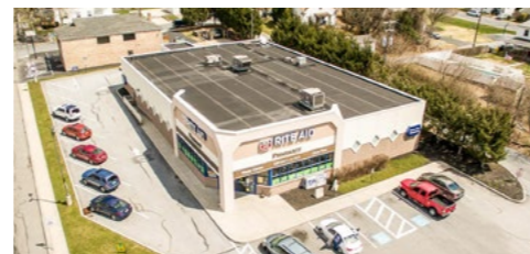
Rite Aid, Harrisburg, PA

“Equity Retail Brokers flawlessly assisted me in both sides of a 1031 Exchange last year. They marketed and properly priced a convenience store sale in Philadelphia that received multiple bids and a very near asking price cash buyer; then they located a solidly leased Starbucks in Wisconsin that exactly met my investment objectives. Their communication was great, including weekends as necessary.”