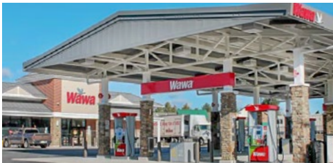
Wawa, Mantua, NJ