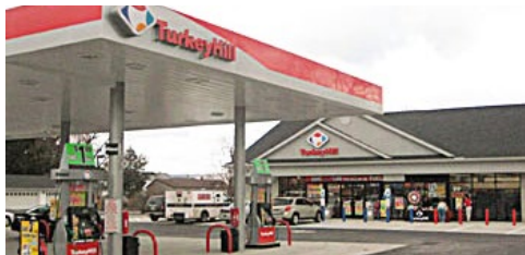
Turkey Hill, Reading, PA