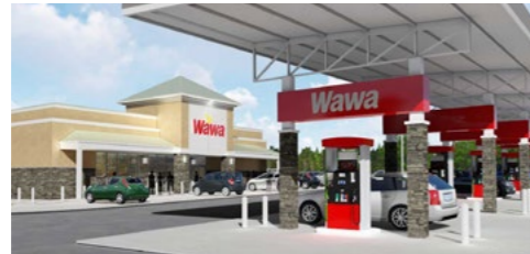
Wawa, Cinnaminson, NJ