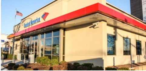
Bank of America, Philadelphia, PA