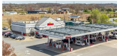
Wawa, Paulsboro, NJ