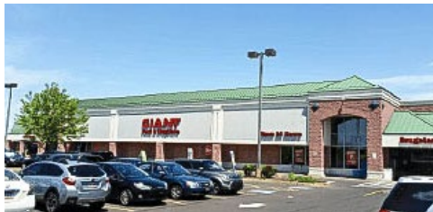
Giant Marketplace, Bensalem, PA