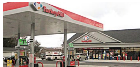
Turkey Hill, Reading, PA