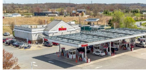
Wawa, Paulsboro, NJ