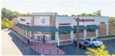
Walgreens, Barnegat, NJ