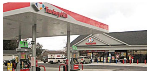
Turkey Hill, Reading, PA