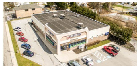
Rite Aid, Harrisburg, PA

“Equity Retail Brokers flawlessly assisted me in both sides of a 1031 Exchange last year. They marketed and properly priced a convenience store sale in Philadelphia that received multiple bids and a very near asking price cash buyer; then they located a solidly leased Starbucks in Wisconsin that exactly met my investment objectives. Their communication was great, including weekends as necessary.”