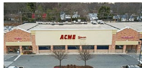
Media Shopping Center, Media, PA