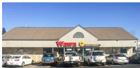
Wawa, Philadelphia, PA