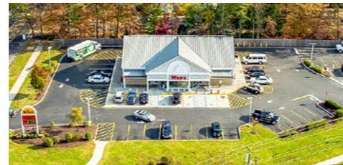
Wawa, Galloway, NJ