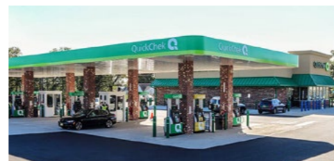
QuickChek, Raritan, NJ