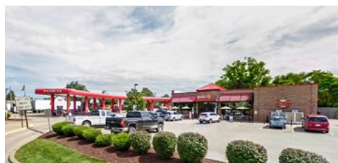
Sheetz, Westmoreland County, PA