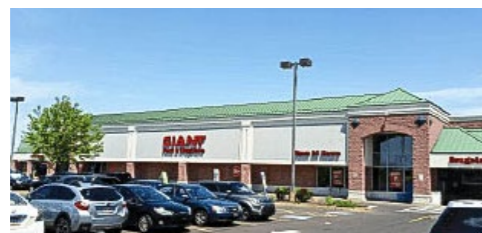
Giant Marketplace, Bensalem, PA