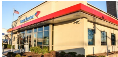
Bank of America, Philadelphia, PA