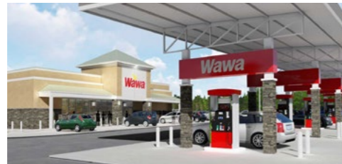
Wawa, Cinnaminson, NJ