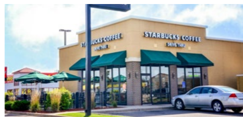
Starbucks, Eau Claire, WI