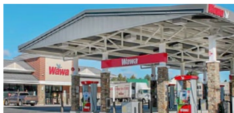
Wawa, Mantua, NJ

Equity Retail Brokers has closed deals totaling over $2 billion throughout 25 years. Here are a few recently sold transactions by our investment sales team.