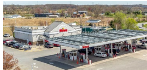
Wawa, Paulsboro, NJ