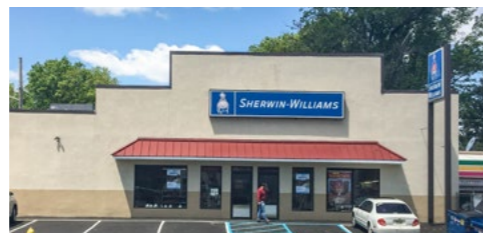
Sherwin Williams, Rahway, NJ