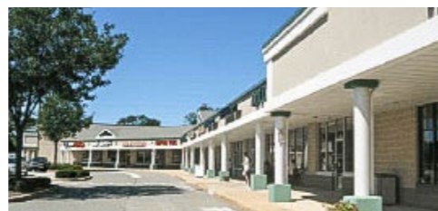
Shoppes at Lionville Station, Exton, PA