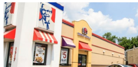
Taco Bell/KFC, Wilmington, DE